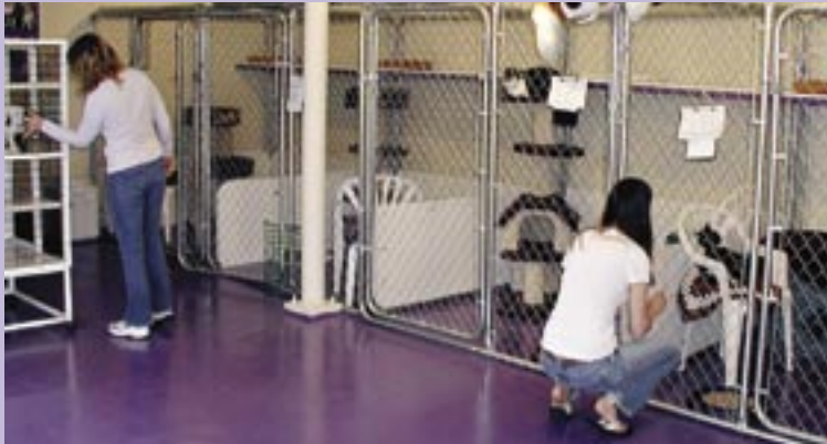
The Adoption Center is located on 17th Street in Pacific Grove