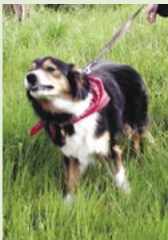
Why can friendly dogs be aggressive while on leash?

So there you are walking along with your wonderful dog, enjoying the walk, loving the beautiful scenery, and thinking about summer and out of the blue that lovely dog you were just admiring turns into Cujo. What the heck! You quickly scan the horizon to see what's brought on that behavior and sure enough there comes a dog. You knew it would be a dog because this has happened several times before. So what's happening?